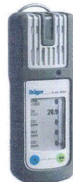
Dräger X-am® 5000 Smallest gas detector for up to 5 gases with advanced functionality.

The optional external pump, which operates with a hose up to 30 (98 feet) meters long, makes it possible to use the detector for pre-entry measurements into confined spaces such as tanks, shafts, etc. The pump starts automatically when the detector is inserted.