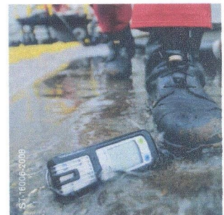
Dräger X-am® 5000 Robust and water-tight.